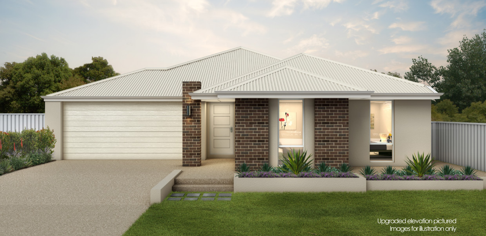
Upgraded elevation pictured Images for illustration only